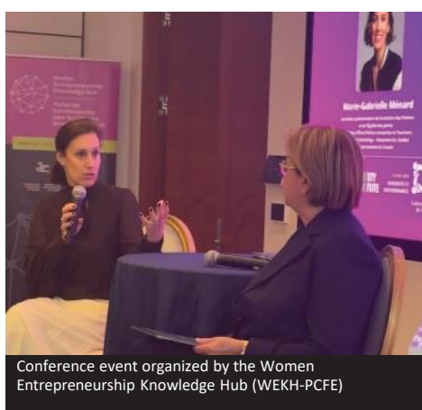
Conference event organized by the Women Entrepreneurship Knowledge Hub (WEKH-PCFE)