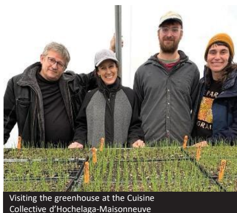
Visiting the greenhouse at the Cuisine Collective d'Hochelaga-Maisonneuve