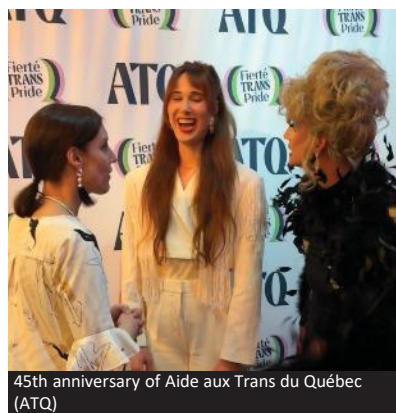
45th anniversary of Aide aux Trans du Québec (ATQ)