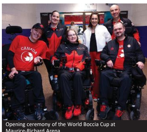
Opening ceremony of the World Boccia Cup at Maurice-Richard Arena