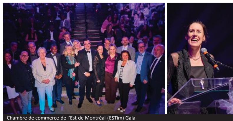
Chambre de commerce de l'Est de Montréal (ESTim) Gala