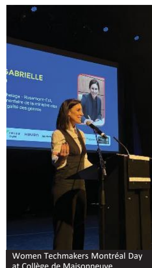
Women Techmakers Montréal Day at Collège de Maisonneuve