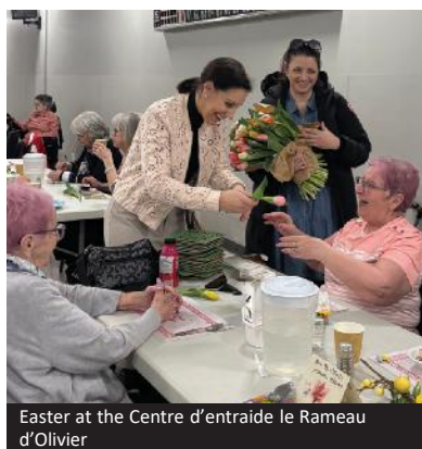
Easter at the Centre d'entraide le Rameau d'Olivier