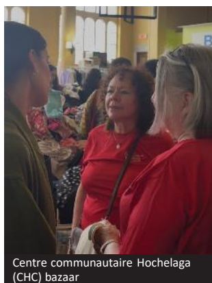
Centre communautaire Hochelaga (CHC) bazaar