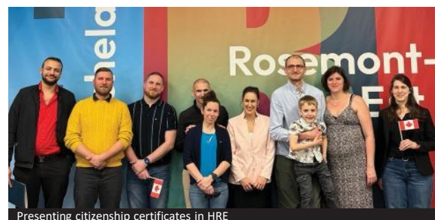
Presenting citizenship certificates in HRE