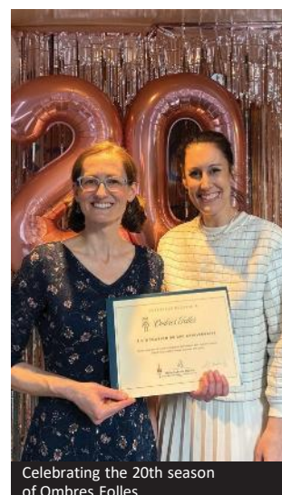
Celebrating the 20th season of Ombres Folles