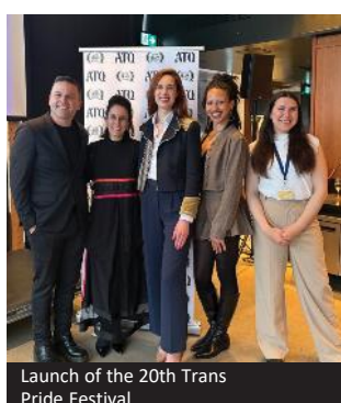
Launch of the 20th Trans Pride Festival