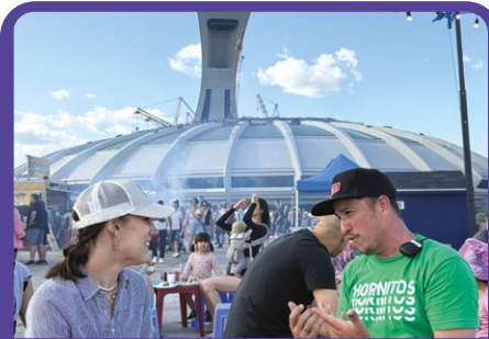
Les Premiers Vendredis