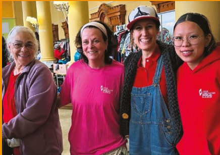
Hochelaga Community Centre Bazaar