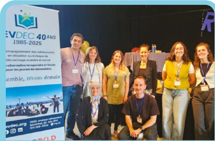
REVDEC's 40 th Anniversary