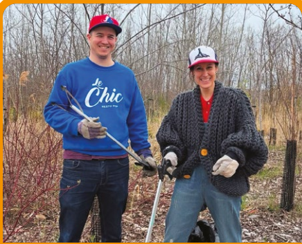
Corvée du boisé Steinberg