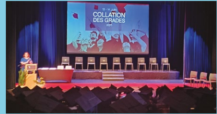
2025 Convocation Ceremony at Collège de Maisonneuve