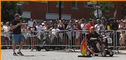
Course des Glorieux Triporteurs