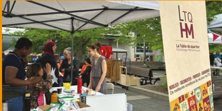
20 th Annual LTQHM Family Day