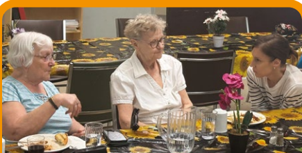
Gala des tournesols de Résolidaire