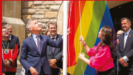
Raising the Pride Flag